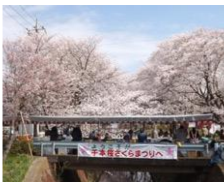
Sen Bon Zakura Festival / Sakura Festival (April)