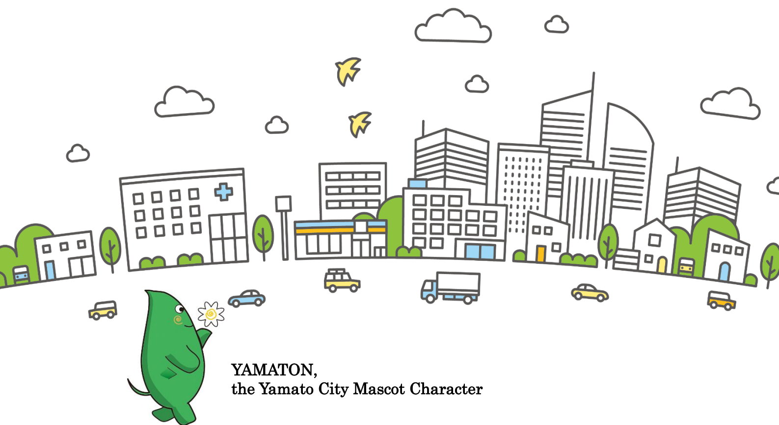
YAMATON, the Yamato City Mascot Character