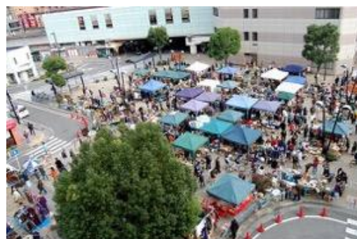
Kanagawa Yamato Old Everyday Tools and Antique Market (Year-Round)