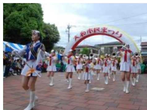
Yamato Citizens' Festival (May)