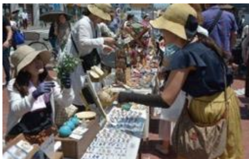
Churinkan Handmade Marché (May/Nov)