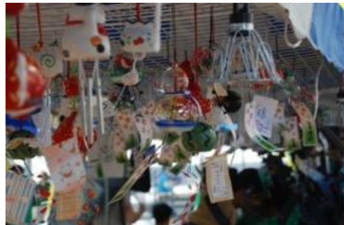
Nishi Guchi Wind Bells Festival (July)