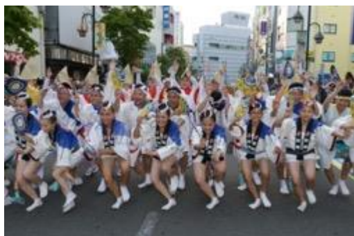
Kanagawa Yamato Awa Odori (July)