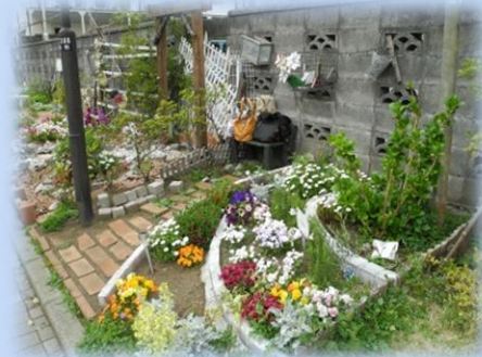
Example of the 17 th City Development Award

The City Development Award aims to promote citizen-led initiatives in city development by recognizing outstanding efforts (activities and examples) in city development within Yamato City and contributions to the promotion of comfortable city development and creation of city that reflect the spirit of Yamato. We look forward to receiving your applications.