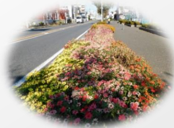
“Where we can meet town folks”

※ Past awards are acceptable for resubmission.