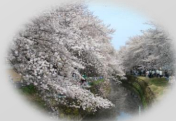
“Where fun events take place”