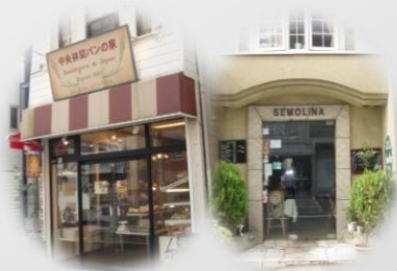
“Where exceptional signboards can be found”