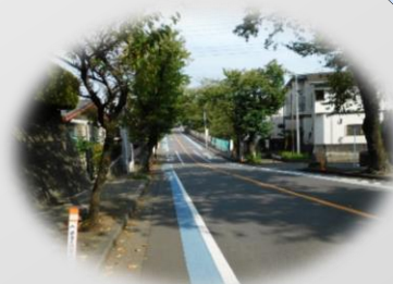
“Where we would like to walk with our children and grandchildren”