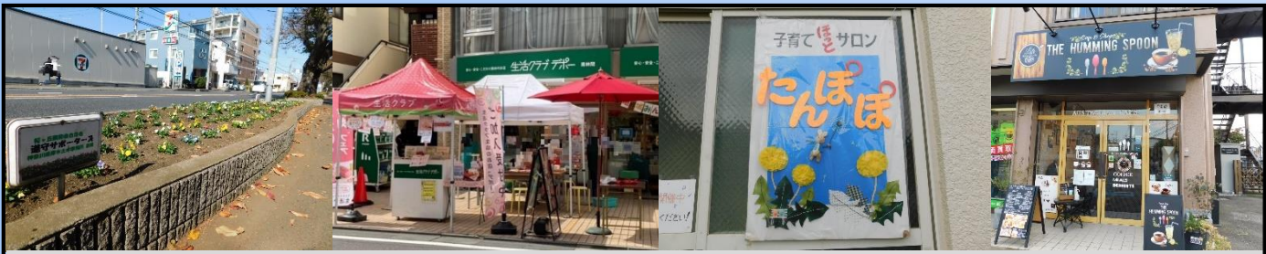
Examples from the 21 st City Development Award (Theme: Where I Belong)