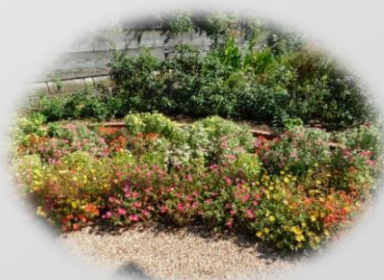
“Where seasons can be felt”